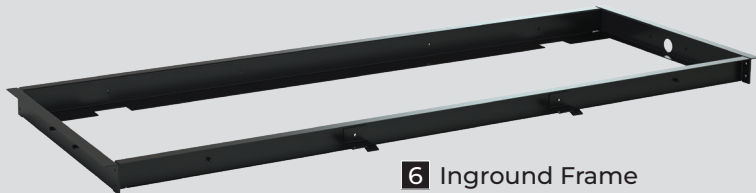
6 Inground Frame