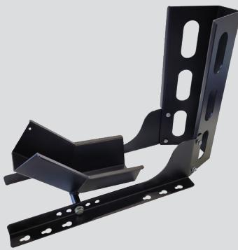
2 Automatic wheel clamp