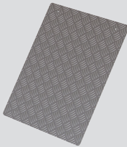
4 Aluminium plate for lifter