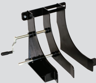
1 Mechanical screw wheel clamp