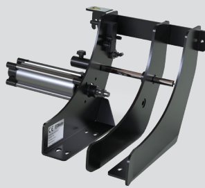
3 Adjustable pneumatic wheel clamp